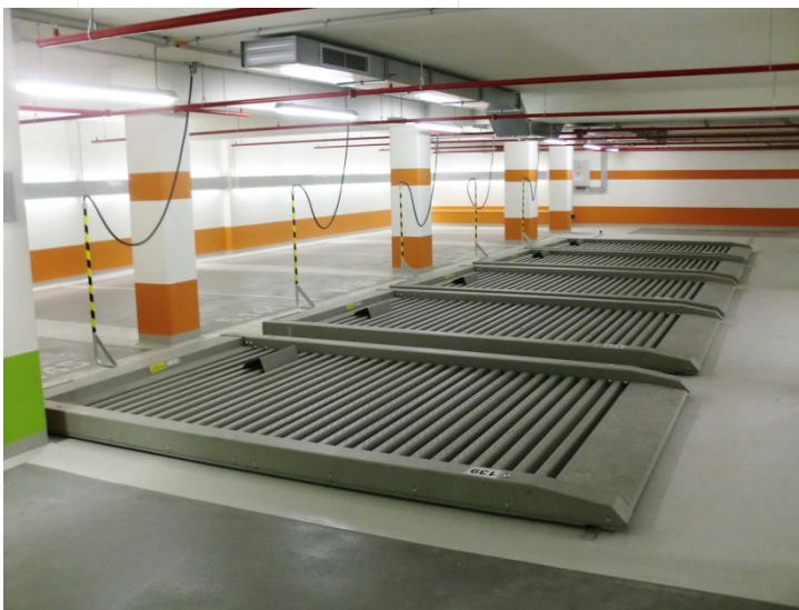
Final design of parking garage (top), vehicle management system (below)